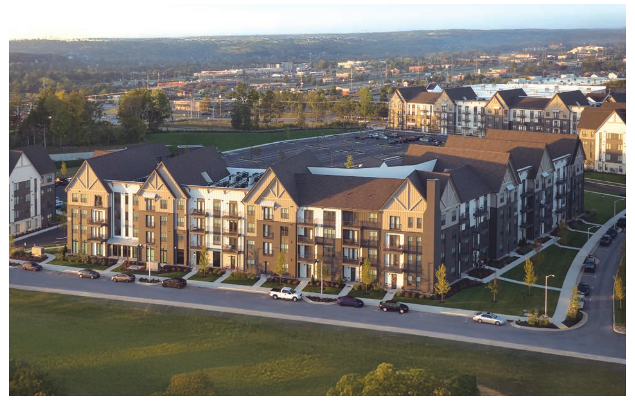
SMYRNA, TENNESSEE • 325 UNITS • COMPLETED 2024