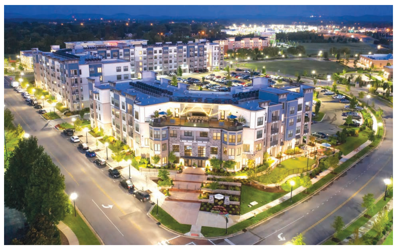
MURFREESBORO, TENNESSEE • 203 UNITS • COMPLETED 2018