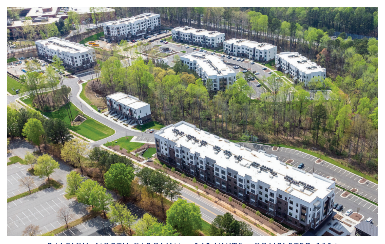
RALEIGH, NORTH CAROLINA • 365 UNITS • COMPLETED 2024