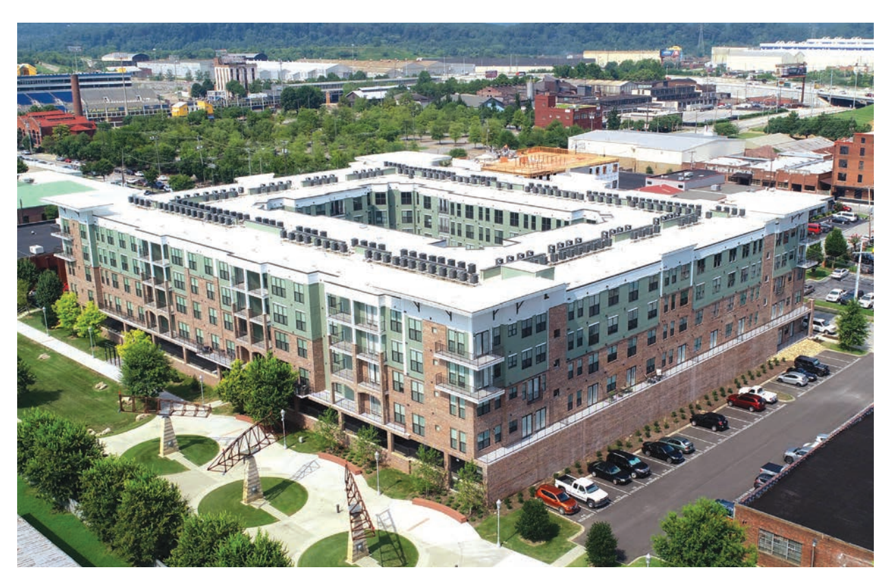
CHATTANOOGA, TENNESSEE • 200 UNITS • COMPLETED 2018