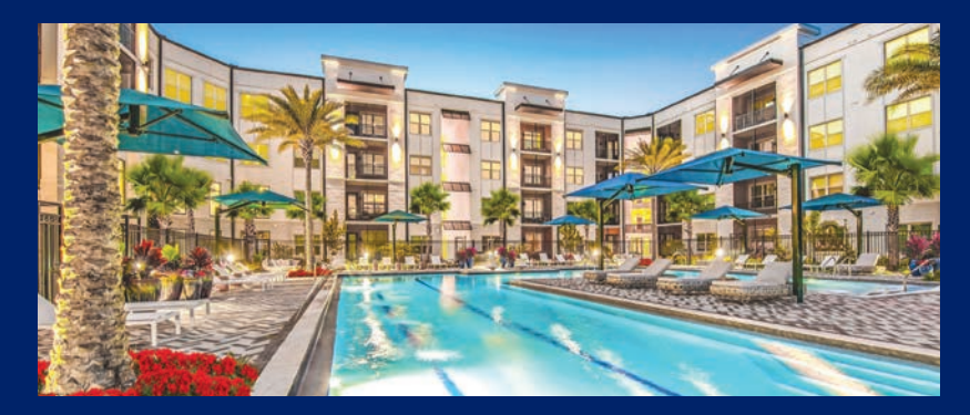
VINTAGE NAPLES • NAPLES, FL • 2026