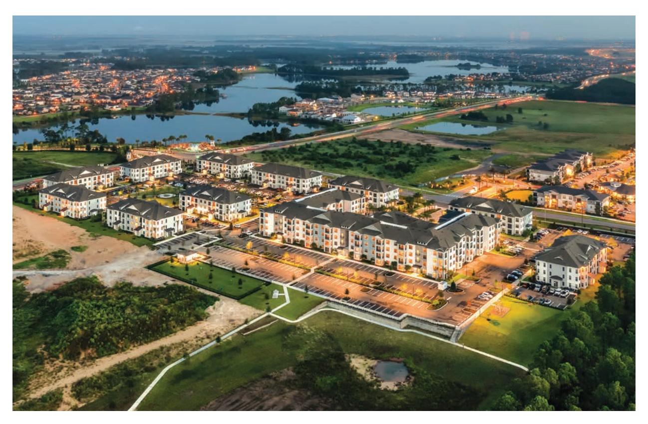
ORLANDO, FLORIDA • 340 UNITS • COMPLETED 2021