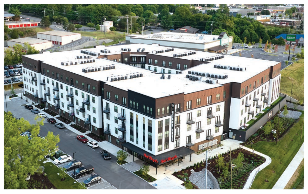
NASHVILLE, TENNESSEE • 191 UNITS • COMPLETED 2024