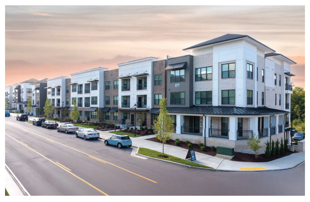
FRANKLIN, TENNESSEE • 245 UNITS • COMPLETED 2024