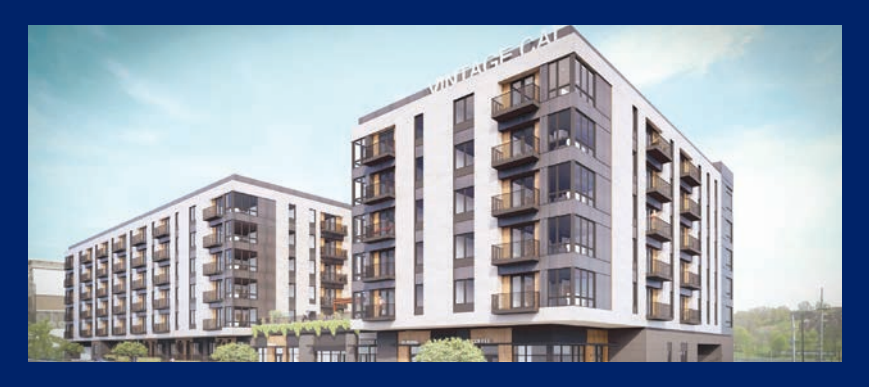
VINTAGE CAL • KNOXVILLE, TN • 2026