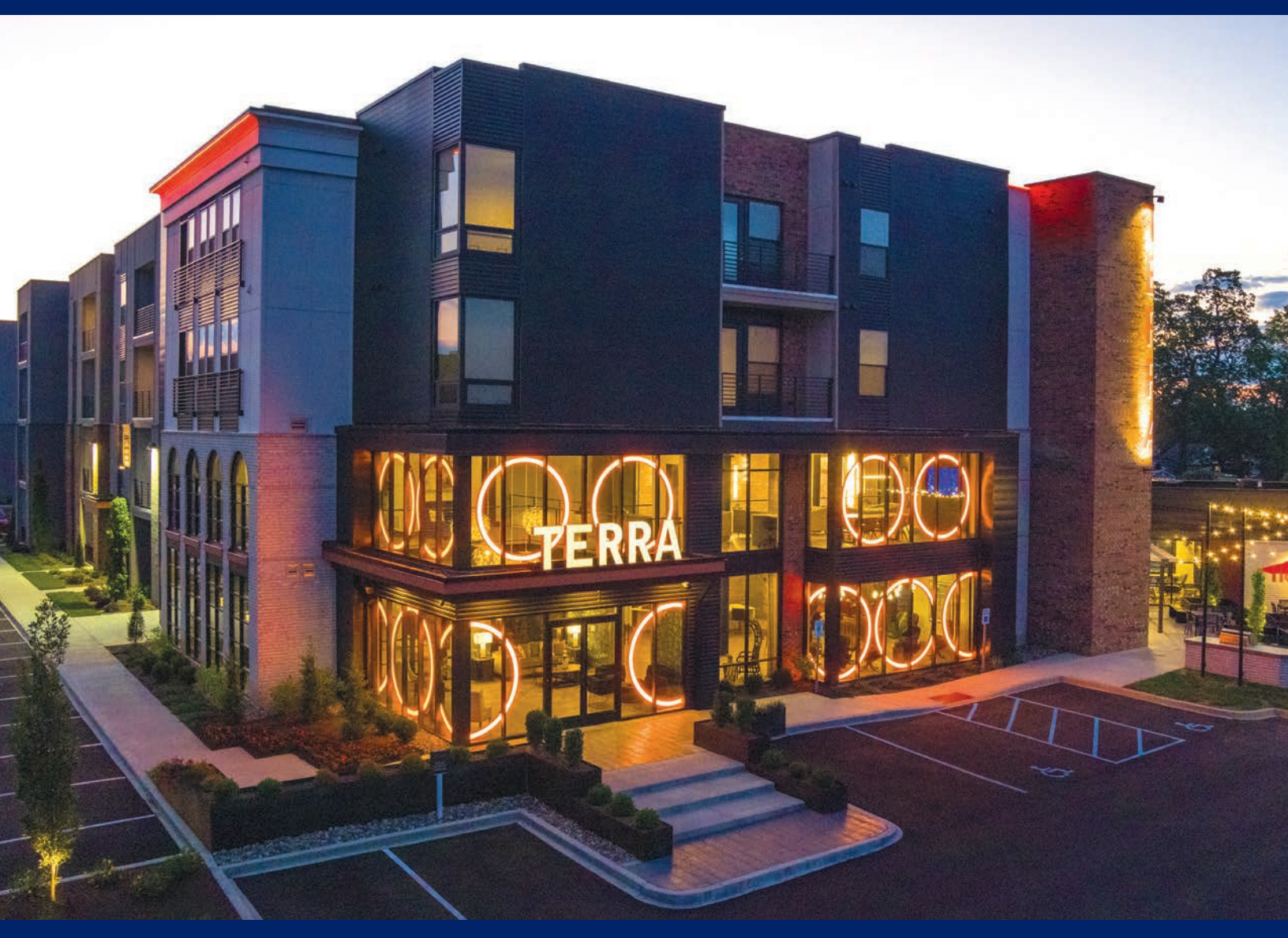
Completed in 2024, Terra in Louisville, Kentucky features 291 luxury apartments.