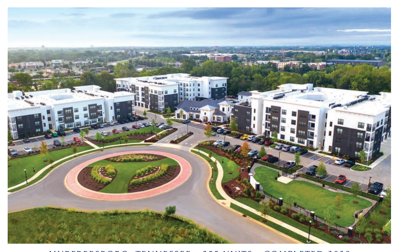
MURFREESBORO, TENNESSEE • 255 UNITS • COMPLETED 2020