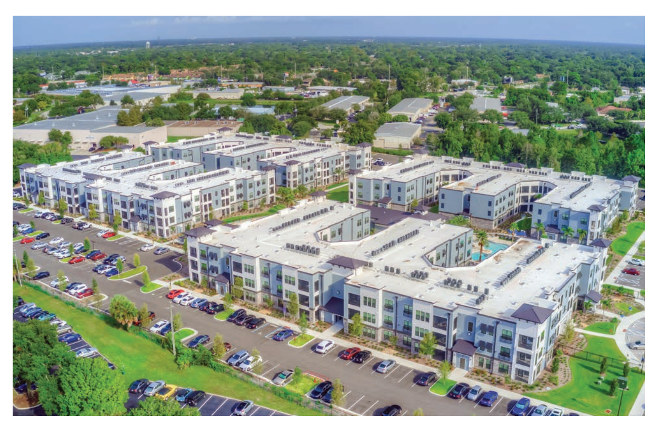
WINTER PARK, FLORIDA • 332 UNITS • COMPLETED 2019