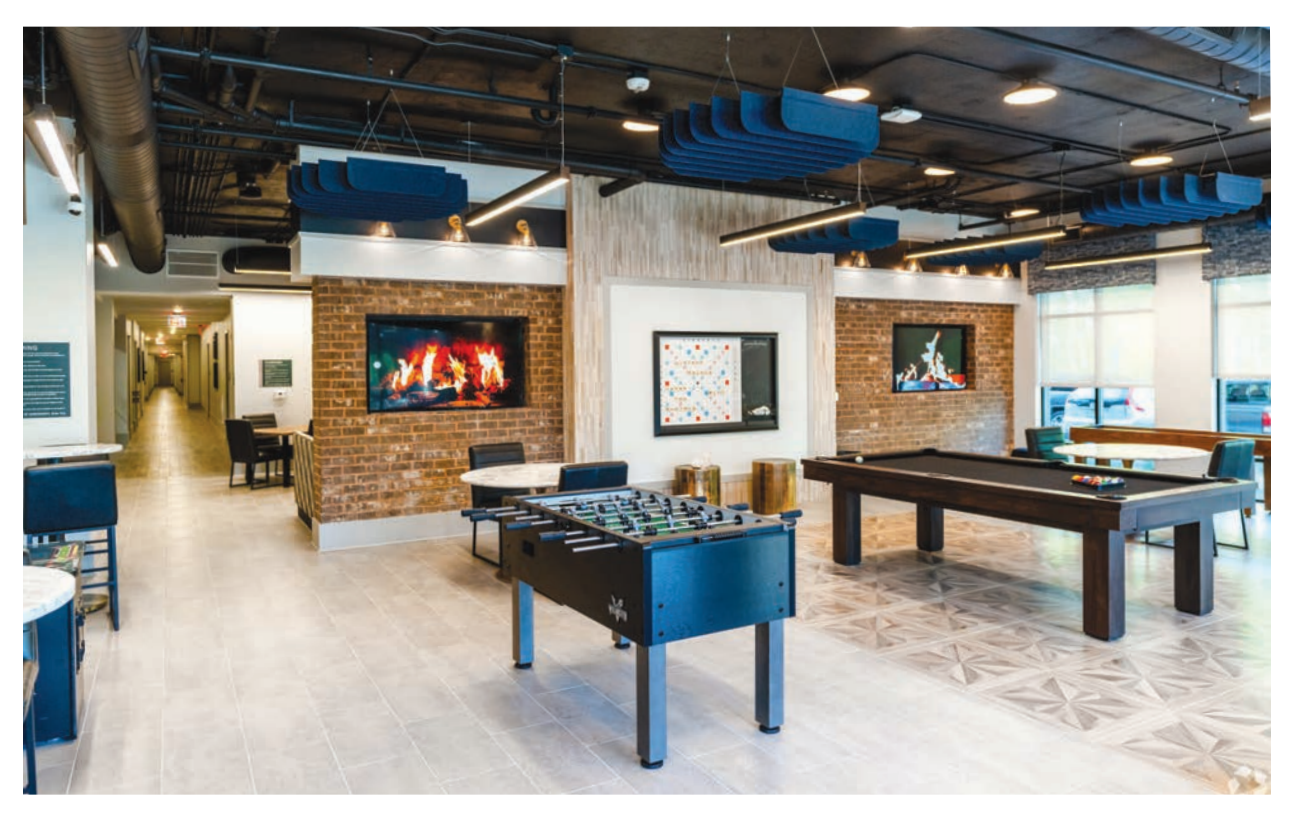
VINTAGE RALEIGH WEST AMENITY SPACE • RALEIGH, NORTH CAROLINA