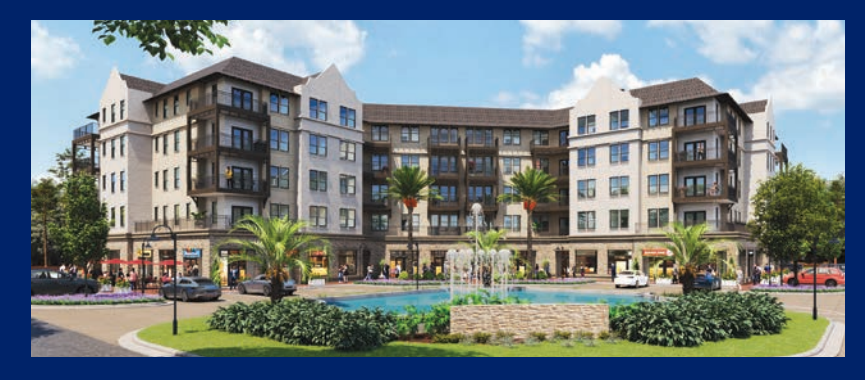
VINTAGE LAKE POWELL • PANAMA CITY BEACH, FL • 2025