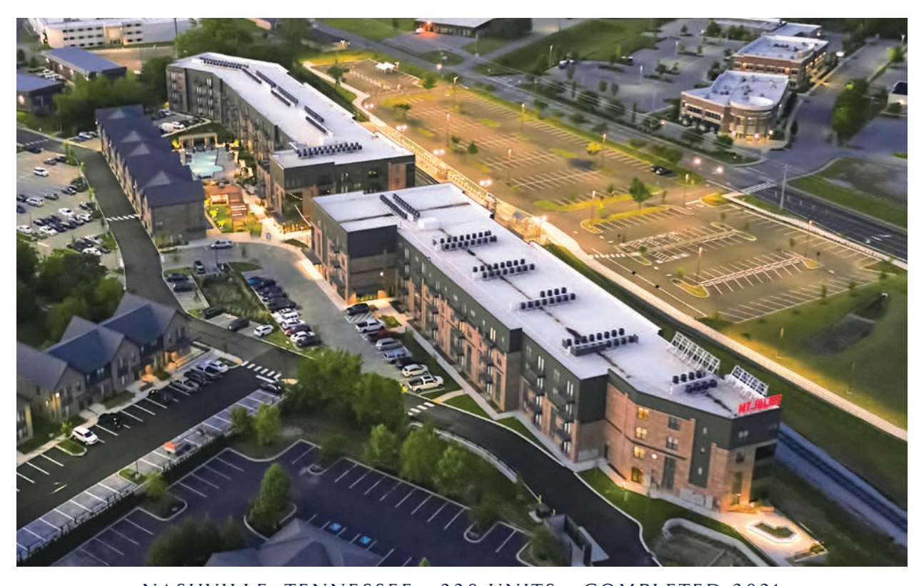
NASHVILLE, TENNESSEE • 220 UNITS • COMPLETED 2021