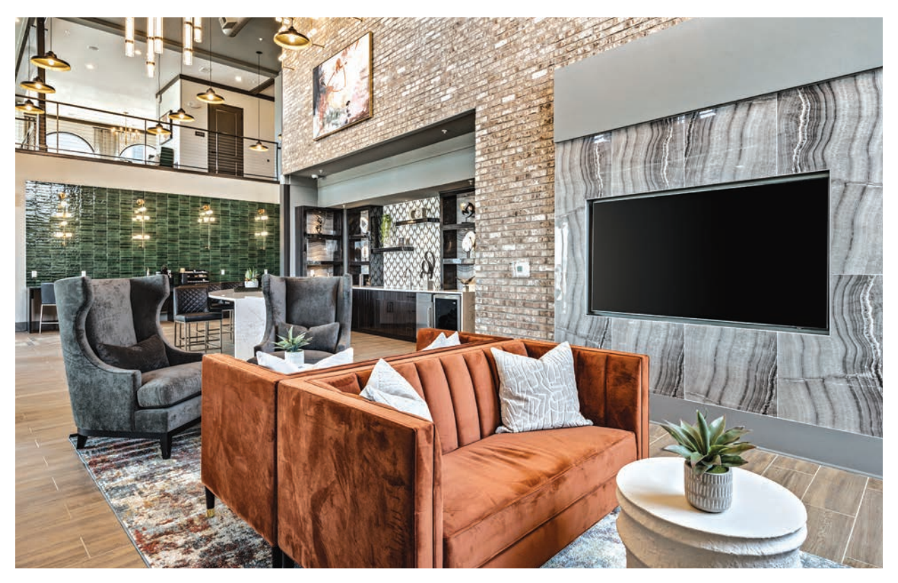
TERRA AMENITY SPACE • LOUISVILLE, KENTUCKY